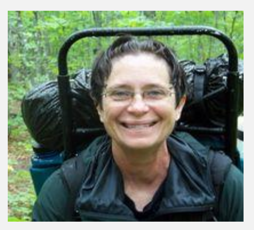
A very rainy day for backpacking on Isle Royale