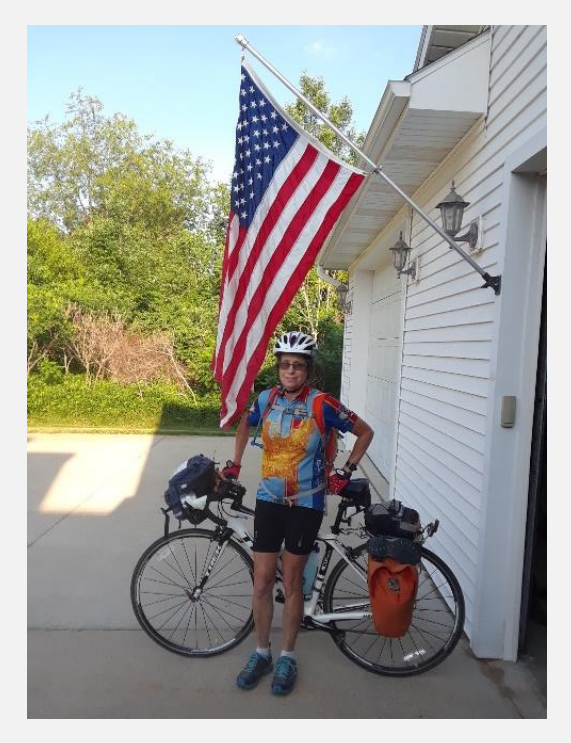
Solo bike trip from Gaylord to Lexington, KY to raise funds for church missions