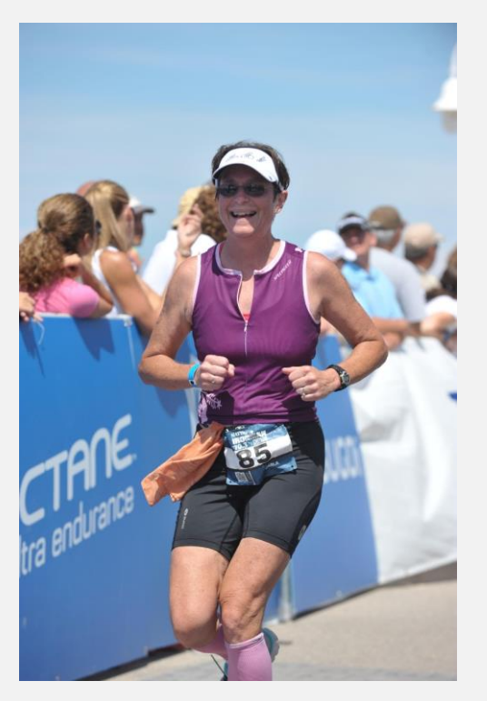
Completion of half-ironman triathlon