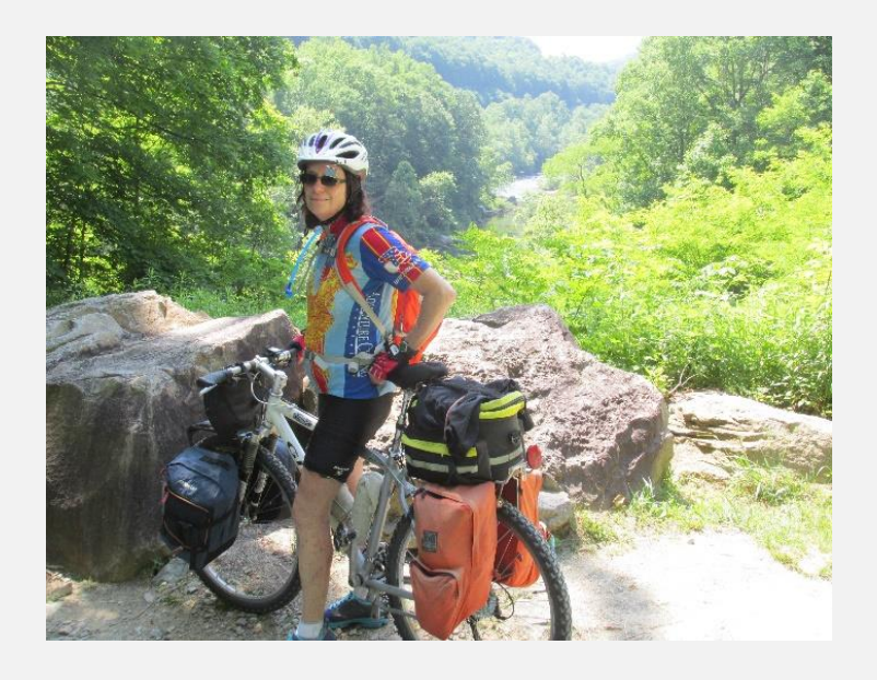
Pittsburgh to Washington DC on the GAP/C&O Canal Trail